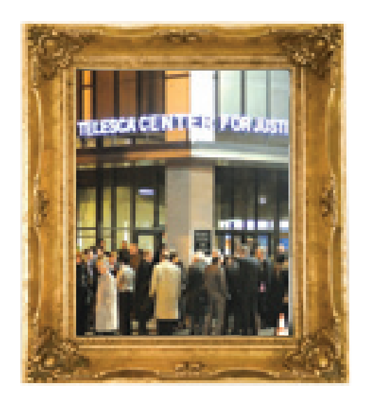
Telesca Center for Justice.